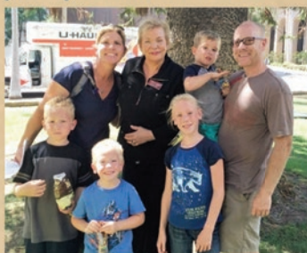
Community Day Winners – all kids play free of charge