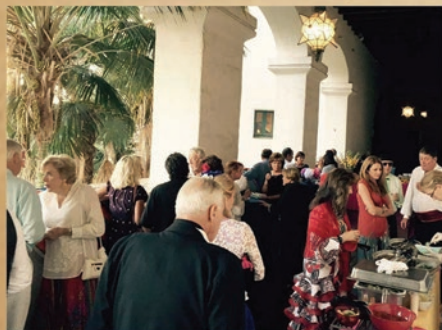
Mexican Feast on the Loggia