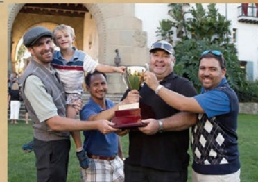
Who will hold the trophy next year?