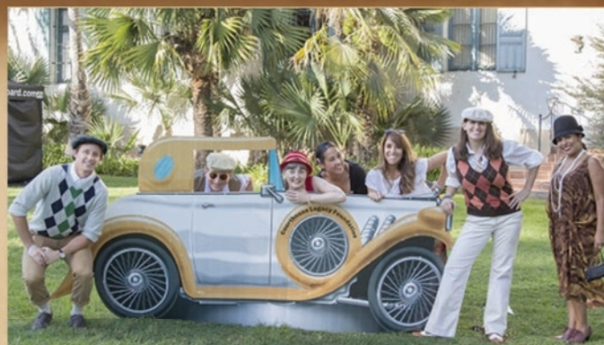
Santa Barbara Foundation Foursomes