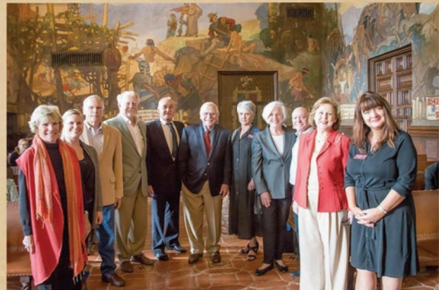
CLF Trustees and Councilman