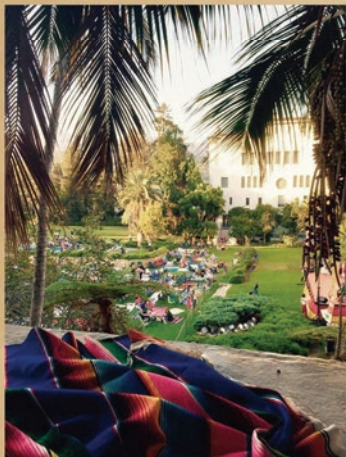
View of the Las Noches de Ronda ("Nights of Gaiety")