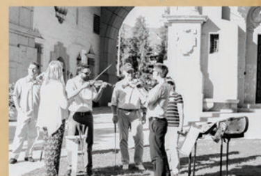
Santa Barbara Symphony hole