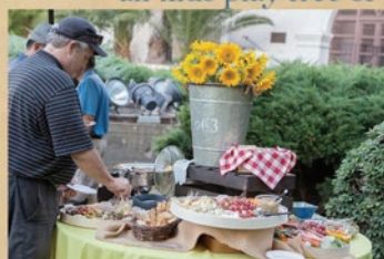
After party in the Sunken Gardens